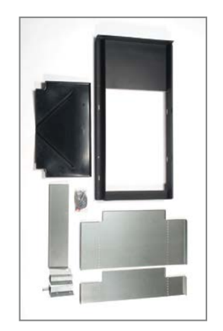
Sleeve Adapter Kit

Vert-I-Pak® is an exact fit for existing First Company SPXR-series single package vertical units when installed with the VPASA1 Sleeve Adapter.