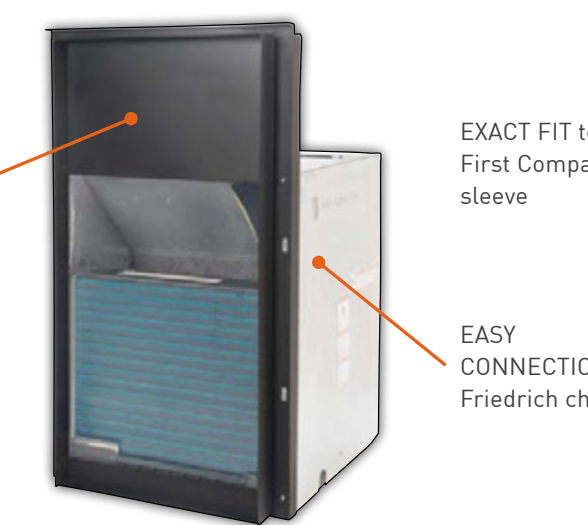
EXACT FIT to First Company

NO EXPENSIVE CUTTING or RE-SIZING of wall opening necessary